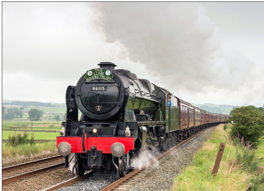
Above: Each year the 'Lune Rivers Trust' operates a special charter working in connection with West Coast Railway. On 8th September, the train should have operated behind LMS 'Royal Scot' No. 46115 Scots Guardsman from Carnforth to Scarborough, via Hellifield & York, but unfortunately the 'Scot' failed at Hellifield on the outward journey with a hot box. The working was to be the locomotive's last of 2012. This was the scene approaching Hellifield, just a few minutes before being failed.

ongoing project to establish the viability of the '57/3s' rescuing Desiro units in the event of a failure.