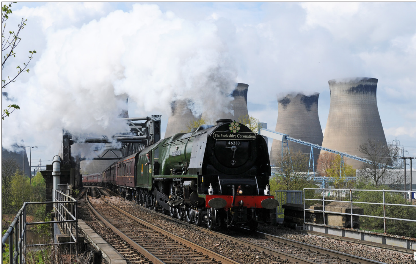
Above: A BR green 'Duchess' has not been seen on the main line for many years, so the return to the National Network of No. 46233 Duchess of Sutherland in the livery was welcomed by many. A telephone vote among enthusiasts had been close run thing between its previous colour scheme of LMS maroon and BR green, but the latter won. Here, the loco heads the 'Yorkshire Coronation' charter past Ferrybridge Power Station en route for York and Scarborough.