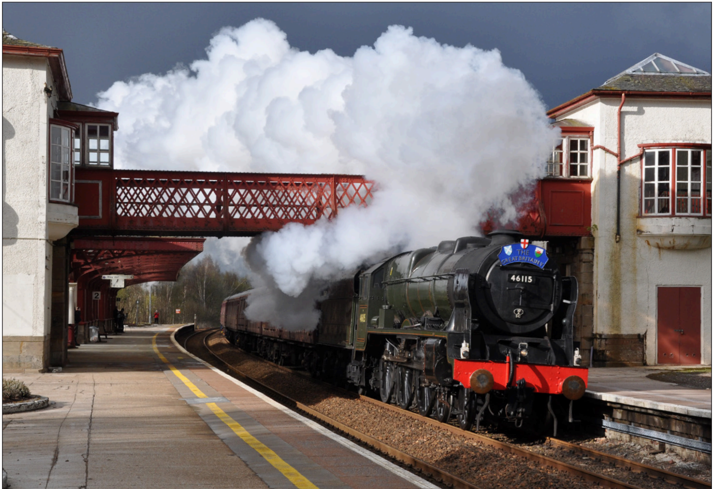
Below: LMS 'Royal Scot' No. 46115 Scots Guardsman powers through Gleneagles Station under a stormy sky with Railway Touring Company's 'Great Britain V' charter on 24th April, bound for Glasgow.

66742 ABP Port of Immingham Centenary 1912-2012, to mark the 100th anniversary of the Port. The naming was carried out by Michael Portillo, who was filming within the docks for his 2013 series of Great British Railway Journey's.