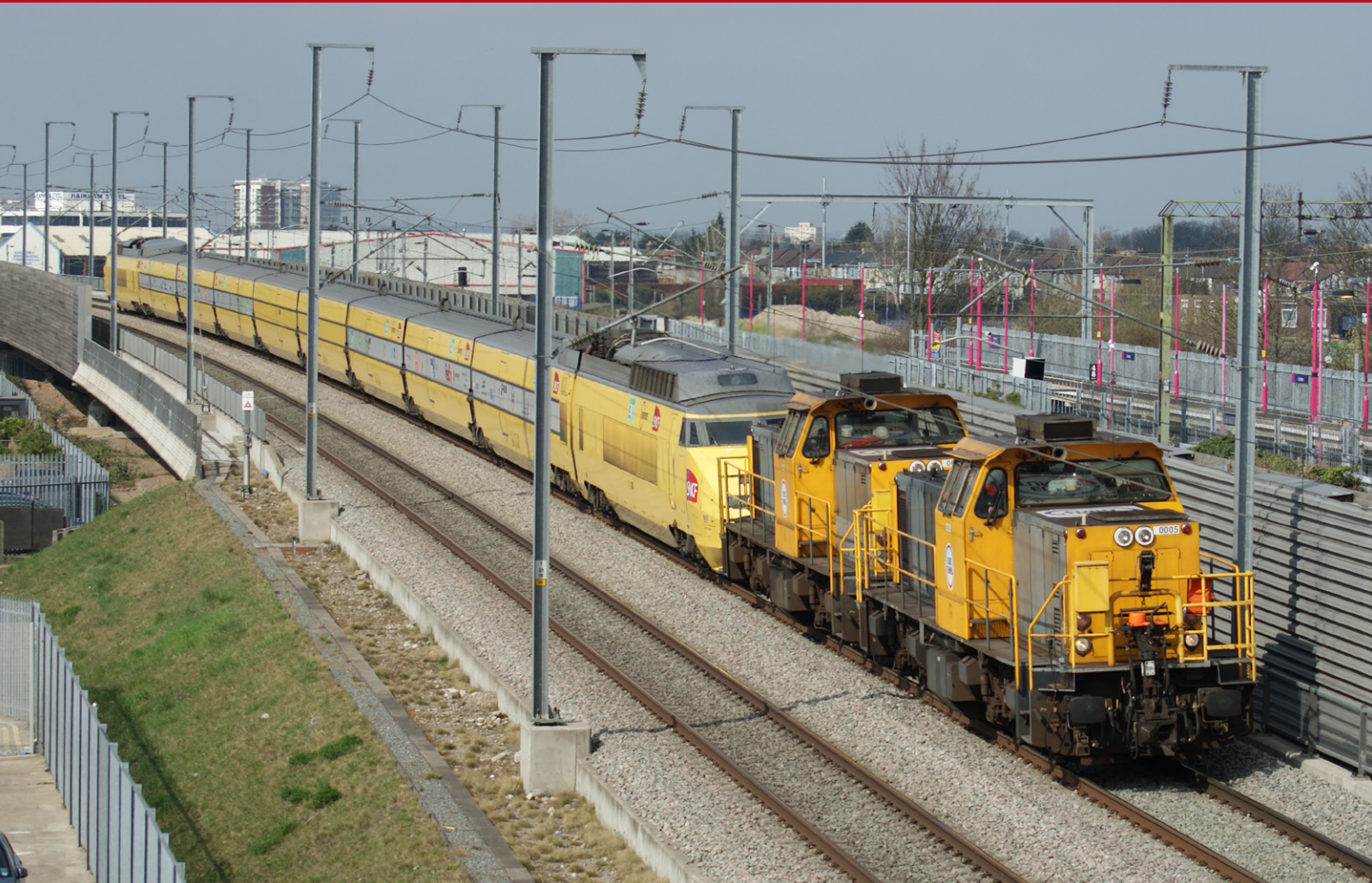
Above: Two of Eurotunnel's Krupp diesel locomotives Nos. 0004 and 0005 pass Rainham in Essex, hauling SNCF TGV Postal unit No. 951 bound for Singlewell Loop, where it would spend the day. The unit, which had been 'dragged' by the two locos from Frethun the previous night, had visited London St Pancras International for a media event. The set had worked under its own power from Lyon to Frethun, via Paris Charles de Gaulle airport. Nicholas Hair