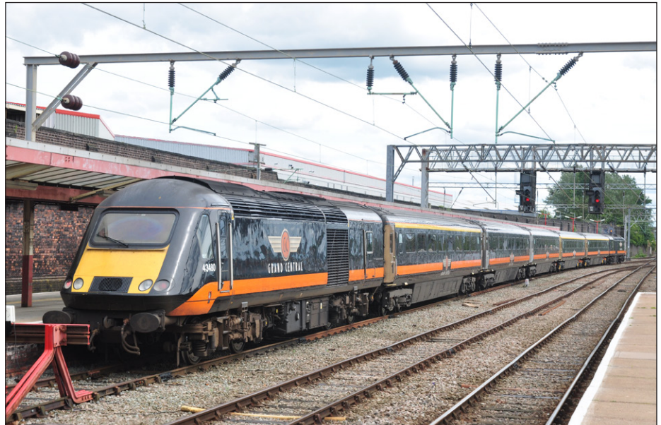
Below: A Grand Central HST is not the most common sight at Crewe! Here Class 43 Power Car No. 43480 brings up the rear of the set on 12th July, as it departs bound for Heaton, via Stoke and Derby after collecting several Mk3 vehicles from LNWR Crewe following maintenance. Geoffrey Dingle

Right: LMS 'Princess Royal' Pacific No. 6201 Princess Elizabeth took charge of the Royal Train on 11th July, from Newport to Hereford, then again from Worcester to Kemble. Here, the second leg of the working climbs away from Standish Junction. John Whitehouse