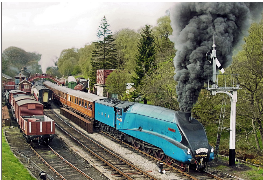
Above: LNER A4 No. 4464 Bittern was one of the visitors to the North Yorkshire Moors Railway in May. Here, it makes a stunning departure from Goathland with the delayed 15:50 service to Pickering on 5th May.

The Epping-Ongar Railway officially reopened its doors on 25th-27th May with a gala weekend, featuring newly acquired GWR 'Hall' No. 4953 Pitchford Hall and visiting GWR 6400 class Pannier No. 6430.