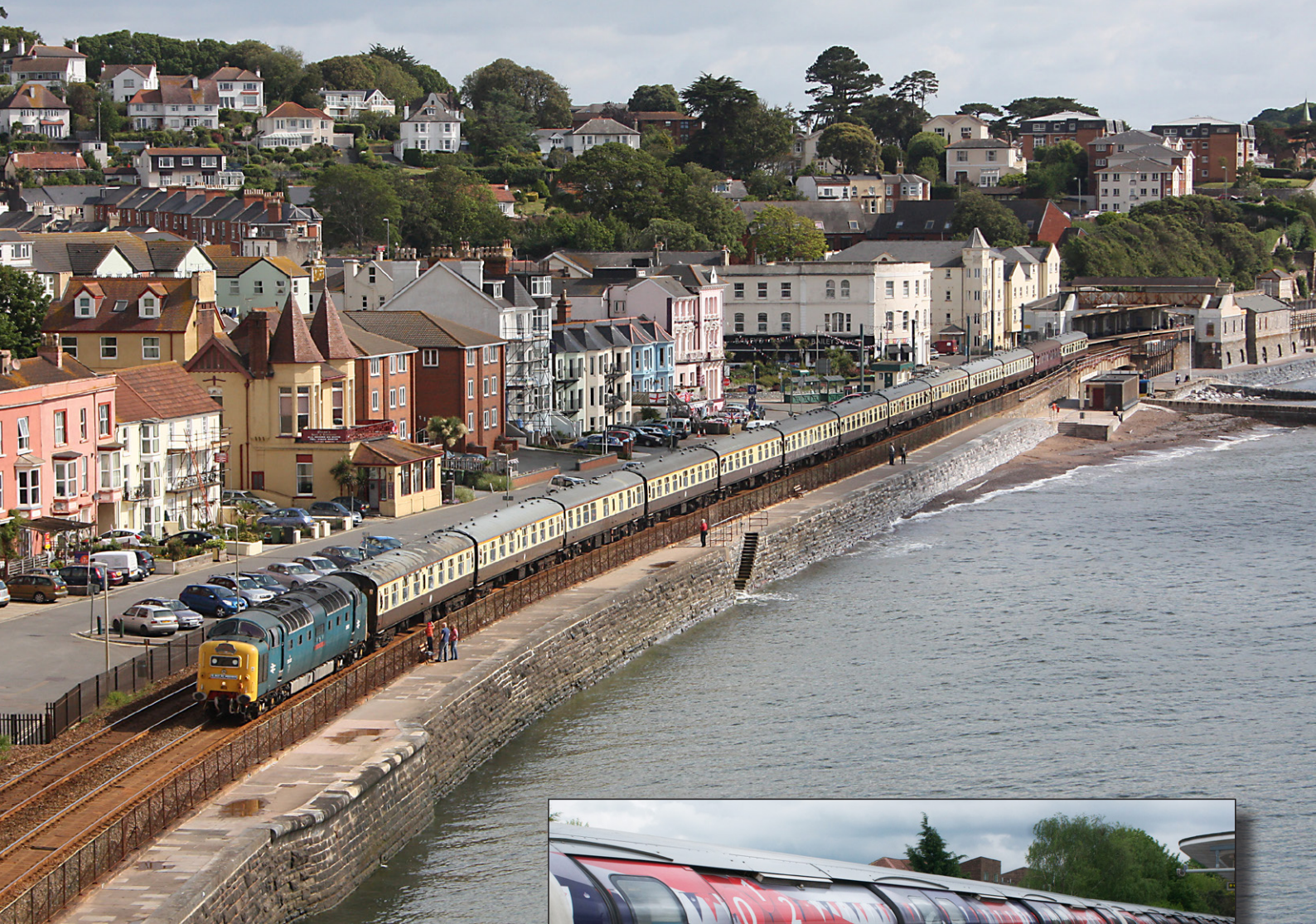
Above: Class 55 Deltic No. 55022 Royal Scots Grey passes Dawlish with Pathfinder Tours charter from Birmingham to Penzance for Mazey Day on 23rd June. Neil Walkling