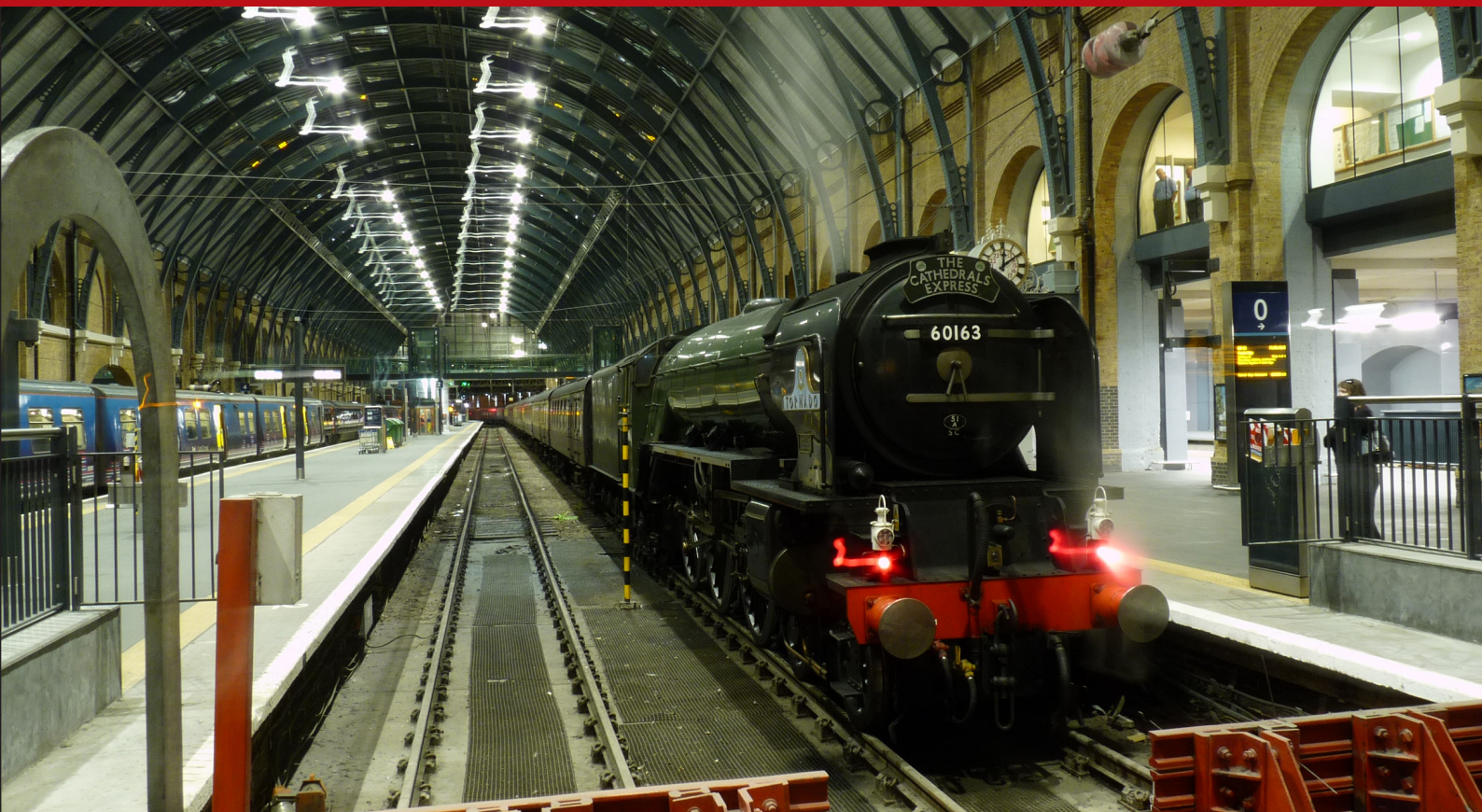
Above: LNER 'A1' Pacific No. 60163 Tornado is pictured stood in King's Cross after working the return leg of a Cathedrals Express charter. The late return of the trip resulted in part of the route back to Southall being closed for an engineering possession, meaning that the locomotive and train was stabled overnight in King's Cross.