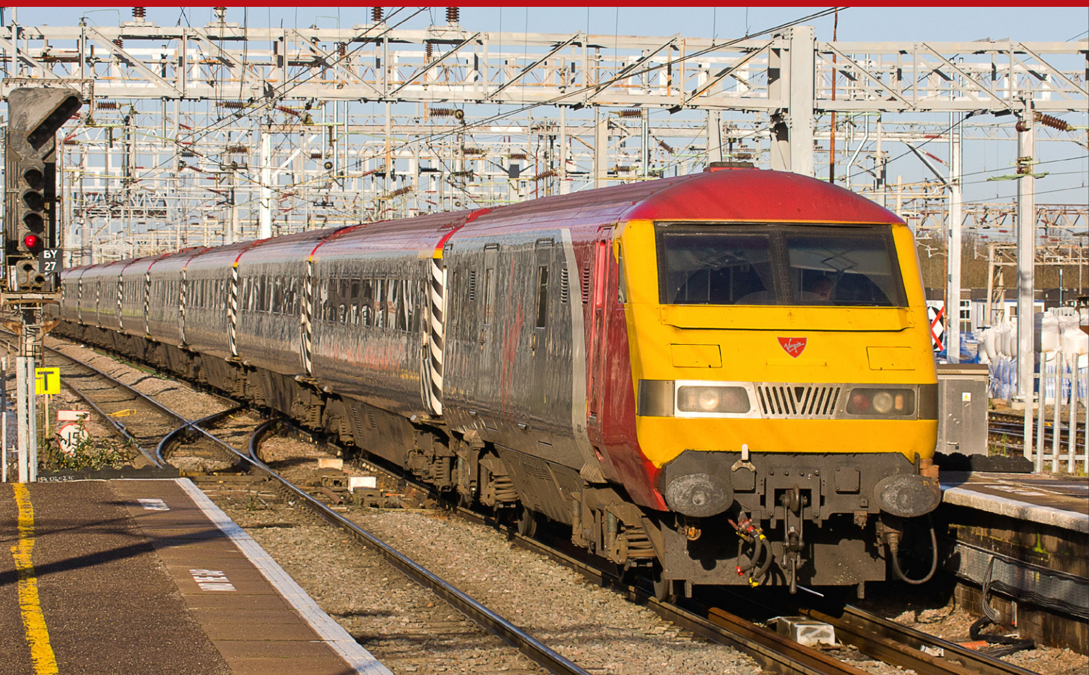
Above: Virgin Trains Mk3 DVT No. 82126 heads south through Bletchley on 23 November, with the weekly 12:08 Northampton to Wembley test working, prior to operating the loco-hauled passenger service to Crewe that evening. Freightliner Class 90 No. 90043 provided the motive power at the rear. Kev Gregory

on 5th/6th November. The locomotive had previously suffered multiple problems, including a failure while in charge of a charter on 19th August.