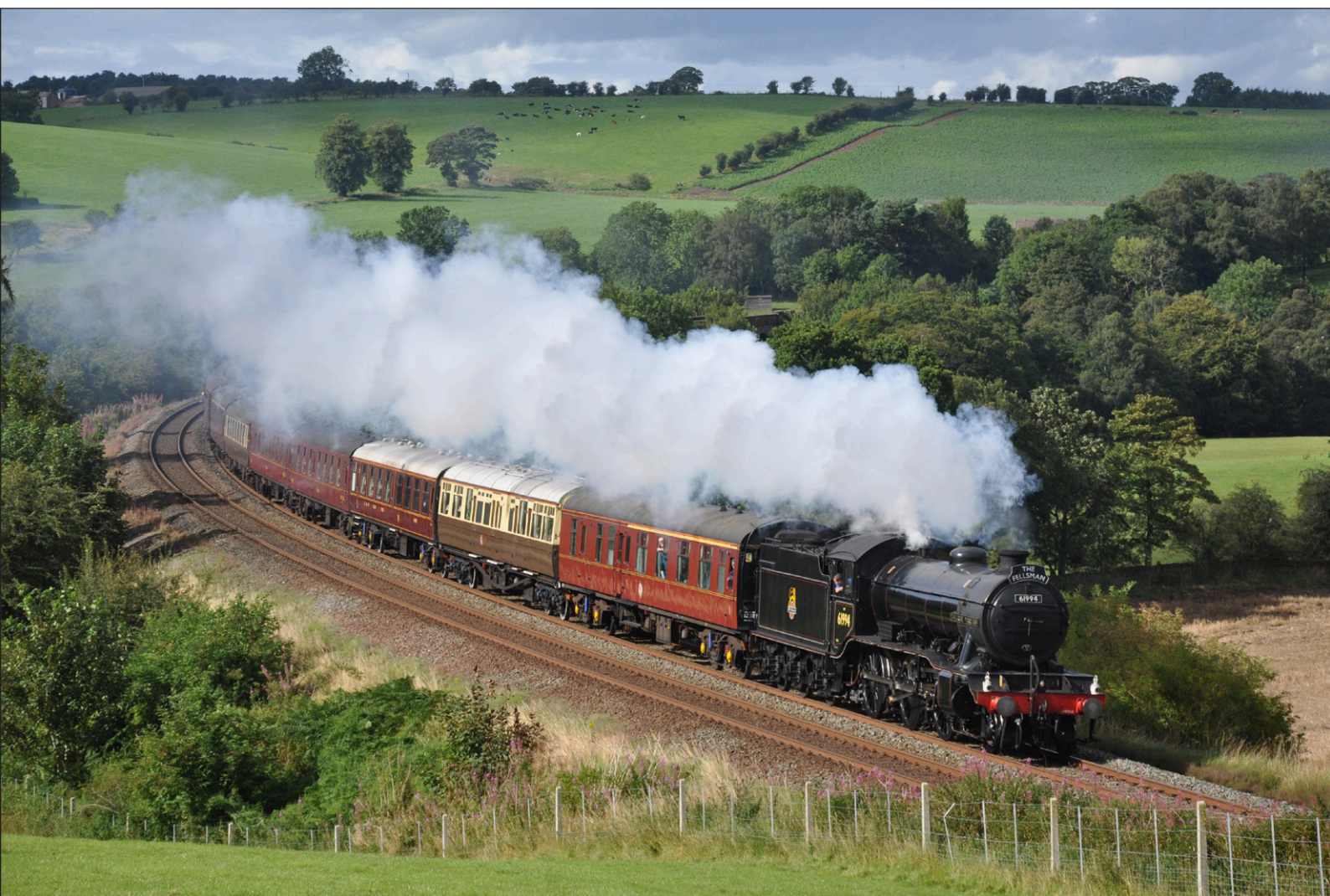
Below: Following some work being undertaken on the locomotive at Carnforth, Scottish-based LNER 'K4' 2-6-0 No. 61992 The Great Marquess was used on a couple of the Lancaster to Carlisle 'Fellsman' charters. Here, the locomotive climbs through Armathwaite with a southbound working on 29th August.