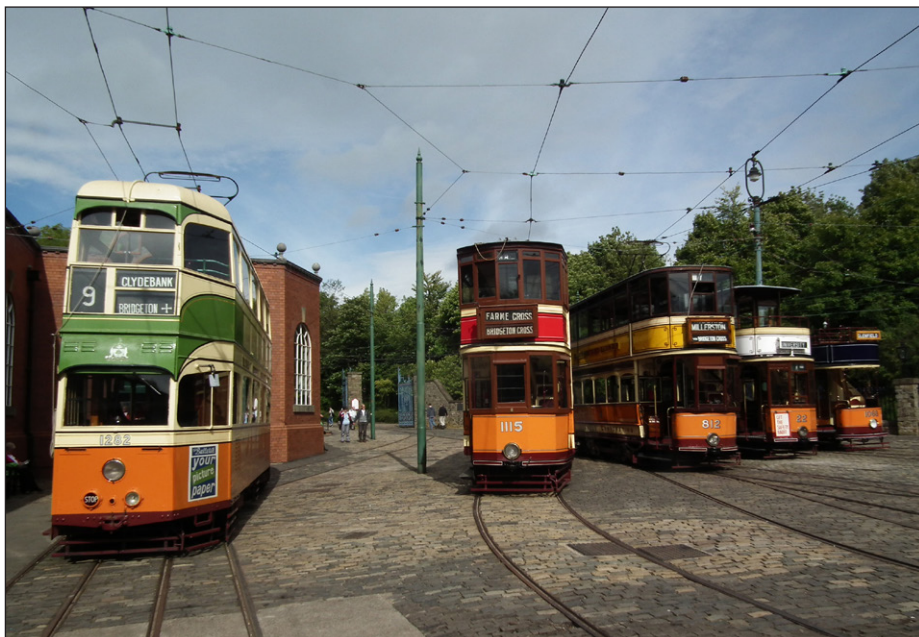
Above: The Crich Tramway Museum paid tribute to Glasgow's tramway in September, to commemorate the 1962 closure of the Glasgow system. The event included a lineup of several cars in the Crich fleet. From left to right are Nos. 1282, 1115, 812, 22 and 1068 on 16th September.

The Strathspey Railway hit the news on 27th September, when a passenger service being operated by Ivatt 2MT No. 46512 derailed approaching the terminus at Broomhill, resulting in the fifth coach leaving the rails.