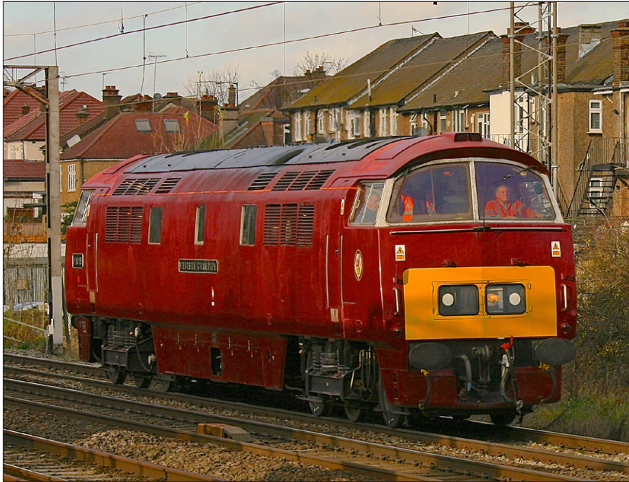
Above: Fresh from repairs at Tyseley, BR 'Western' No. D1015 Western Champion passes South Kenton working 'light engine' to Old Oak Common, on 22nd November. This was to be the locomotives only mainline working in 2012, although the 'Western' is expected to return to main line charter operations next year. Neil Prior

chord will include a six-span viaduct over the ECML, together with approach embankments and new signalling.