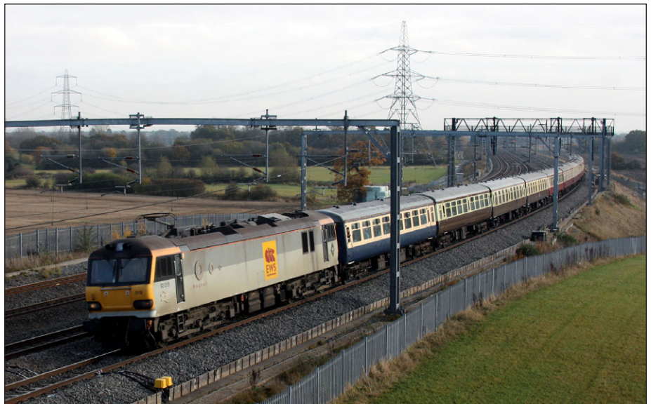
Above: DB Schenker Class 92 No. 92019 Wagner approaches Lichfield Trent Valley on the West Coast Main Line while providing power for the London to Crewe leg of UK Railtours' 08:07 London Euston to Sheffield 'The Pennine Panorama 2' charter.