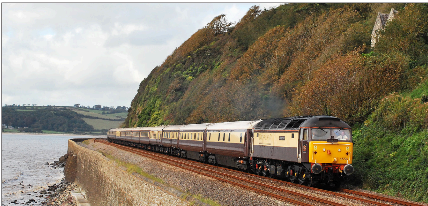
Below: One of the most photogenic railway locations in South Wales, St Ishmaels, between Llanelli and Carmarthen where the railway hugs the estuarial coast of the Afon Tywi, is the location for the Northern Belle excursion returning from Fishguard on 14th September, with DRS Class 47/7 No. 47790 Galloway Princess leading the consist. Stuart Warr