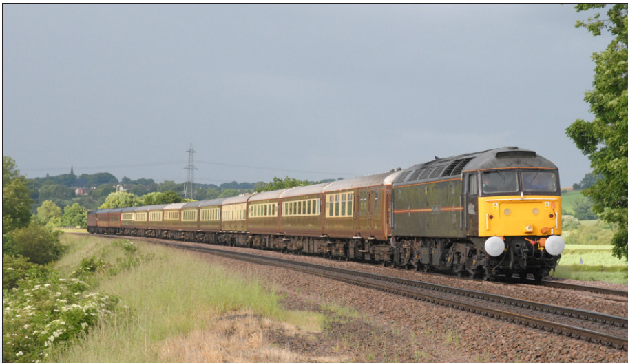
Above: The NRM's Royal Class 47 No. 47798 sweeps through Slitting Mill on a wet summer's evening with a charter returning from Berwick-upon-Tweed to Hereford on 30th June. The locomotive spent part of the summer on loan from the Museum to West Coast Railway.

A Northern Rail Class 144 derailed near St Bees, Cumbria, on 30th August after running into a landslide. There