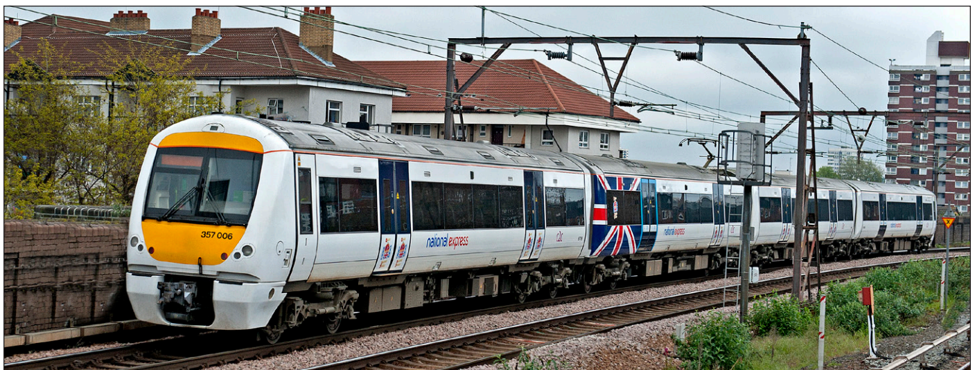
Below: Having been named at Fenchurch Street station earlier in the day, c2c Class 357/0 Electrostar No. 357006 Diamond Jubilee 1952 - 2012 passes Shadwell on return to East Ham Depot on 4th May.