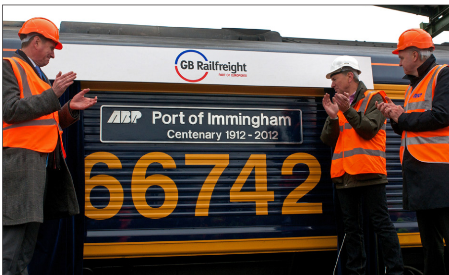
Below: To mark the centenary of Immingham Docks, which was created by the Great Central Railway, GB Railfreight provided Class 66/7 No. 66742 for a naming ceremony within the Port complex on 27th April. The unveiling was carried out by Michael Portillo.

The first of the 1000 series trams to receive the latest yellow and grey colours of Manchester Metrolink was unveiled early in the month, with No. 1003 being the recipient. And in Birmingham, Centro signed the contract with CAF at the end of the month for 25 new trams for Midland Metro. This followed the awarding of 'Preferred Bidder' status earlier in the year. Work has also started on the