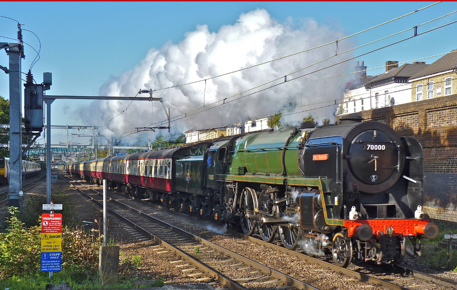
Above: BR Standard 7MT Pacific No. 70000 Britannia gathers speed as it passes Forest Gate on 10th October, with the 'Great Eastern' charter, from London Liverpool Street to Norwich. The charter, comprising of blood and custard Mk1s, would have brought back many memories of the past, creating a fair recreation of the 1950's expresses.

Northern Ireland Railways closed Larne Harbour station at the beginning of the month in order for the platforms to be extended to allow them to accommodate six-car trains. The work was completed by 4th November, when the station was reopened.