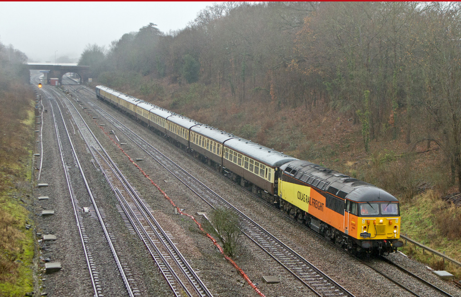
Above: Colas Rail Class 56 No. 56094 became the first of the Colas fleet to work a passenger service on 22nd December, when it was provided for the Birmingham to London, London branches and London to Crewe sections of Pathfinder Tours 'The Thames Angerman' charter, pictured here ambling along the slow lines at Twyford.