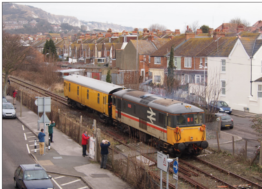
Middle: A Network Rail working operated over the disused Folkestone Harbour branch as far as Tram Road, just short of the viaduct on 24th February. Here, Class 73/2 No. 73205 Jeanette powers the return working back up the grade to rejoin the main line through Folkestone Central. Andrew Wood

Cambridge, to be called Cambridge Science Park. It will be built on the site of Chesterton Sidings, with construction starting in early 2014. On 18th February, the Modern Railway Society of Ireland marked the end of the Class 450 'Castle' class, with a charter working taking in much of the fleet's old stamping ground. In preparation for a forthcoming ballast train programme between Londonderry and Castlerock, driver training on NIR's GM-built diesel locomotives took place on the closed branch to Antrim in Northern Ireland in early February. After 14 years service, the 12 two-car 2700 Class DMUs built by GEC Alstom are to be withdrawn from IE service from March. The first 80 Class DEMUs were cut up during the month at Ballymena, prior to being moved to a local scrapyard. During late February, a major event happened for Irish Railfreight with the introduction of a new intermodal flow for IWT from Ballina to North Wall.