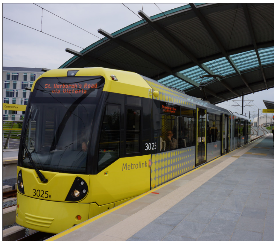
Below: Manchester Metrolink tram No. 3025 calls at Central Park station working a service from Oldham Mumps to St. Werburgh's Road on the first day of operation, 13th June. The bridge in the distance crosses the Network Rail line from Manchester to Rochdale. Paul Cobeck

GWR Hawksworth-designed Class 9400 Pannier Tank No. 9466 was damaged at the Mid-Norfolk Railway on 20th June, when a collision occurred between the locomotive and Class 20 No. D8069. The tank locomotive was subsequently moved to the South Devon Railway for repairs, before returning to the Mid-Norfolk in early August