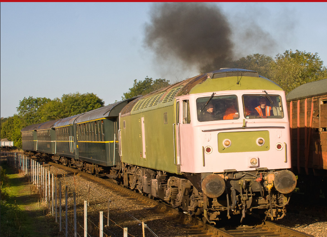
Left: BR Class 47/7 No. 47765 leaves its mark over the Cambridgeshire countryside as it claggs its way out of Wansford, on 29th September, working the 08:40 service to Peterborough Nene Valley during the second day of the Nene Valley Railway's 'Autumn Diesel Gala'. Kev Gregory