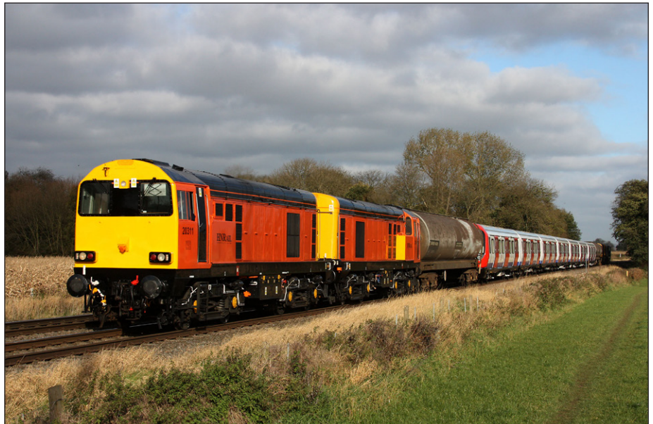
Above: HN Rail Class 20/3s Nos. 20311 and 20314 lead the 11:42 Old Dalby to Amersham S-Stock delivery through East Goscote, Leicestershire, on 7th November. BR blue-liveried Class 20s Nos. 20096 and 20107 were on the rear.

The 71A Locomotive Group began an appeal for funds to repair its Class 33 No. 33012/D6515, which failed with defective axlebox bearings en route to the Swanage Railway Diesel Gala in May. The appeal hopes to raise £40,000 for the work.