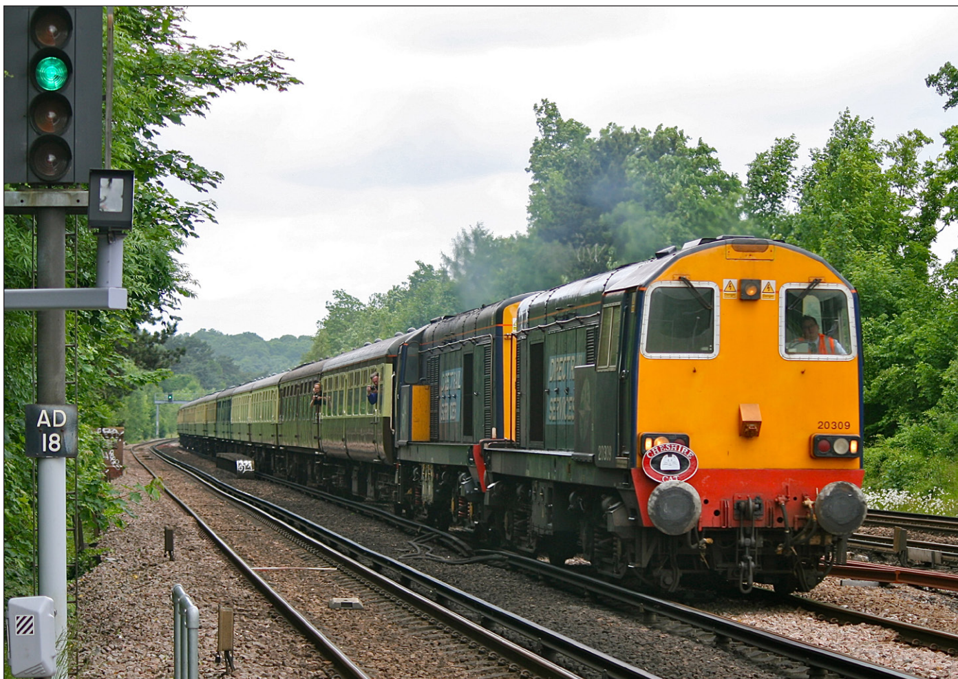
Above: Shattering the suburban silence on a Saturday lunchtime, Class 20/3s Nos. 20309 and No. 20312 approach Chislehurst station working a Cheshire Cat charter from Whitchurch, near Shrewsbury, to Canterbury West on 16th June.