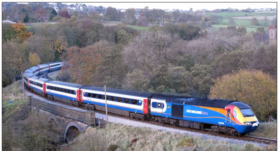
Below: EMT Class 43 Power car No. 43082 The Railway Children leads an East Midlands HST set along the Worth Valley on 3rd November 2012, with classmate No. 43059 at the rear, passing Mytholmes near Haworth with the 'The Worth Valley Wonderer' East Midlands Trains Charity Special from London St. Pancras. Andrew Wood