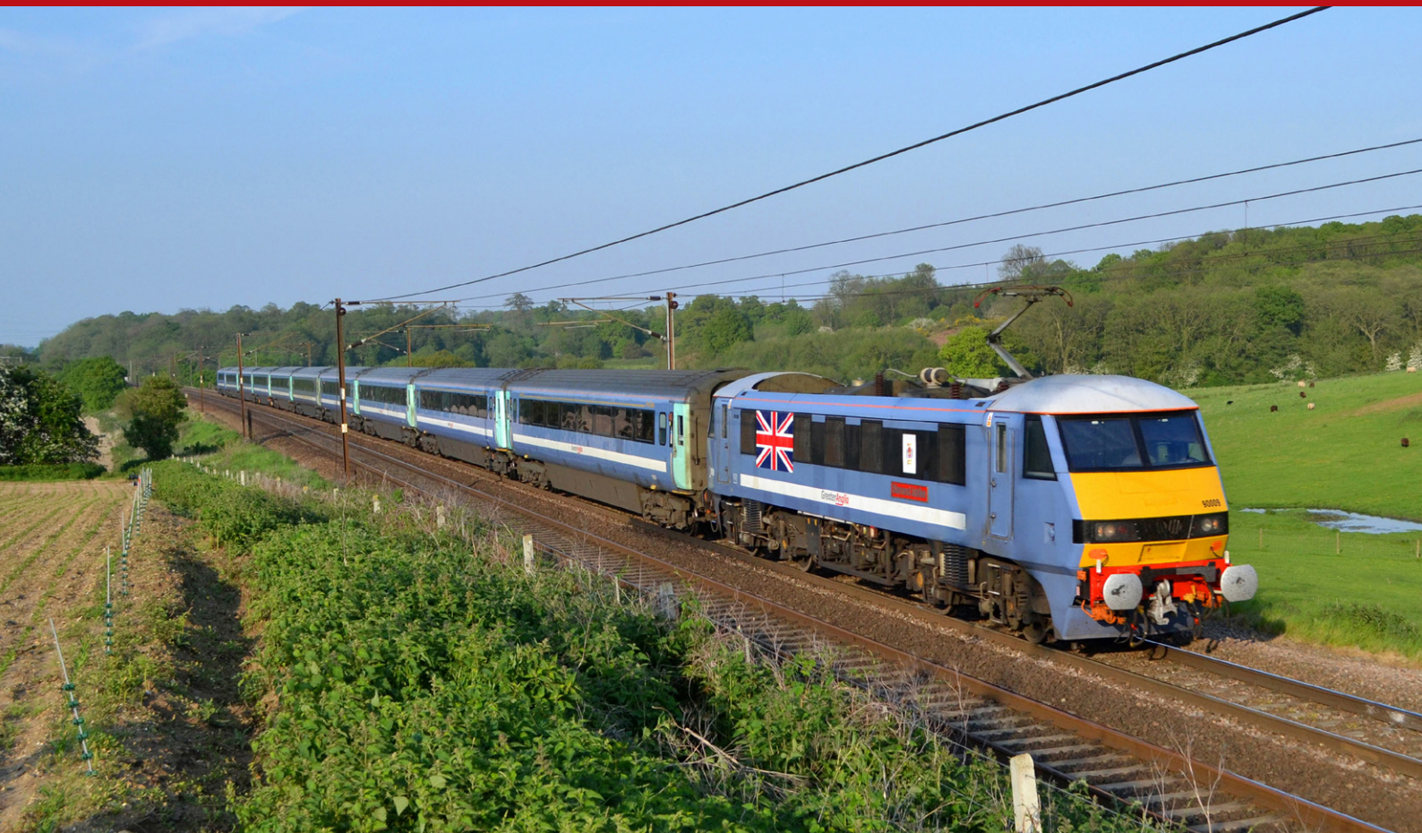
Above: Greater Anglia Class 90 No. 90009 Diamond Jubilee , complete with its bodyside Union Flag passes Belstead in the evening sunshine with the 18:00 Norwich to London Liverpool Street service on 22nd May. Jonathan Kirkham