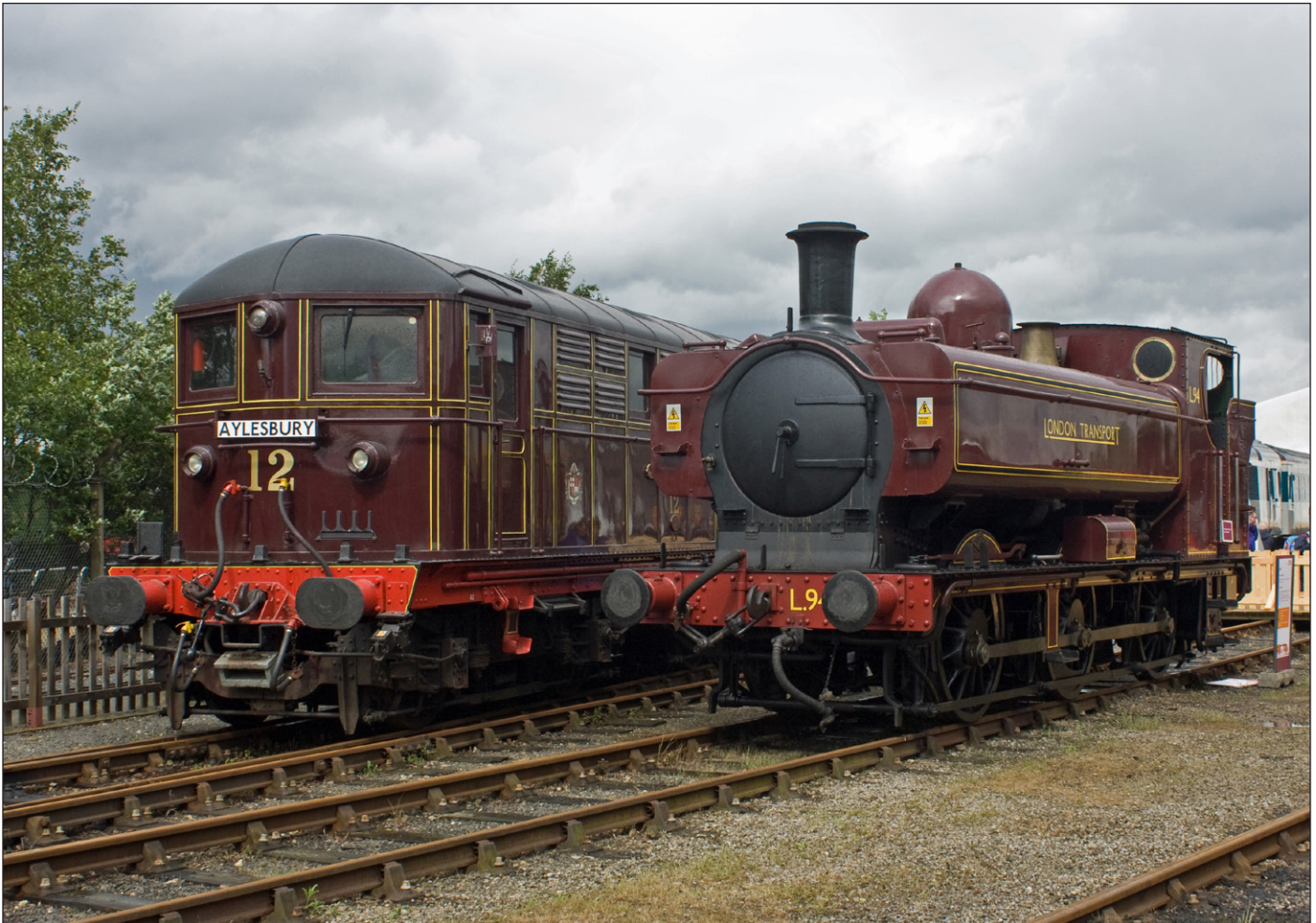
Above: Two Metropolitan locomotives from the same period, although ironically the electric locomotive is several years older! No. 12 Sarah Siddons, introduced in 1923, stands beside 5700 Class No. 7754 (L94), a class introduced from 1929, at York Railfest.