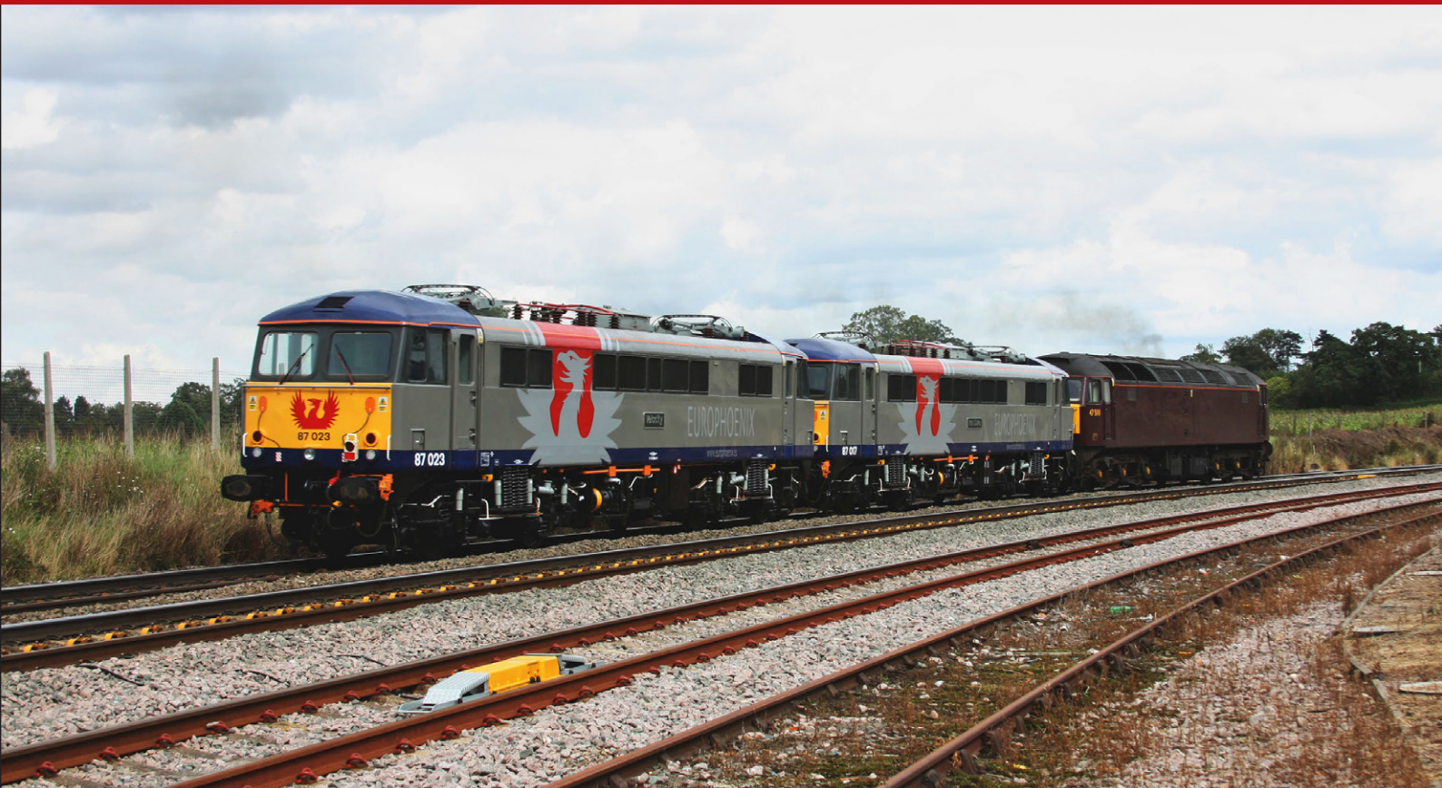
Above: WCR Class 47/4 No. 47500 heads for Willesden TMD with Class 87 Nos. 87017 Iron Duke and 87023 Velocity in tow, near Whitacre Junction, on 28th August. The convoy was en route from Long Marston with the two Europhoenix Class 87s that are to be exported to Bulgaria.