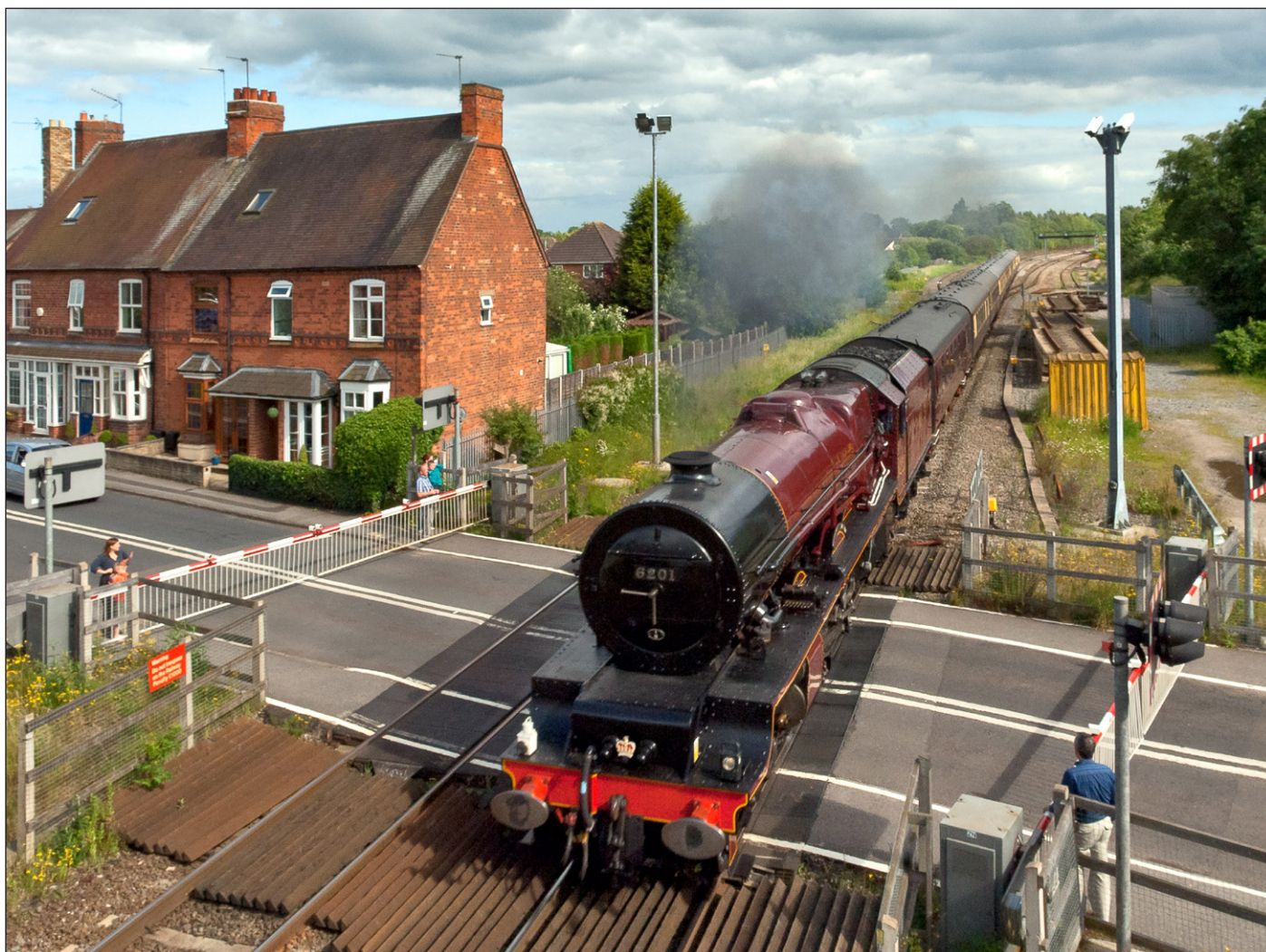
Below: LMS 'Princess Royal' Pacific No. 6201 Princess Elizabeth powers through Bentley Heath crossing with the second return journey of the Shakespeare Express on 1st July 2012.

announced that it is to jointly fund the electrification of the Paisley Canal line with ScotRail, allowing the DMUs to be replaced. The £12 million project is due to be completion in December 2013.