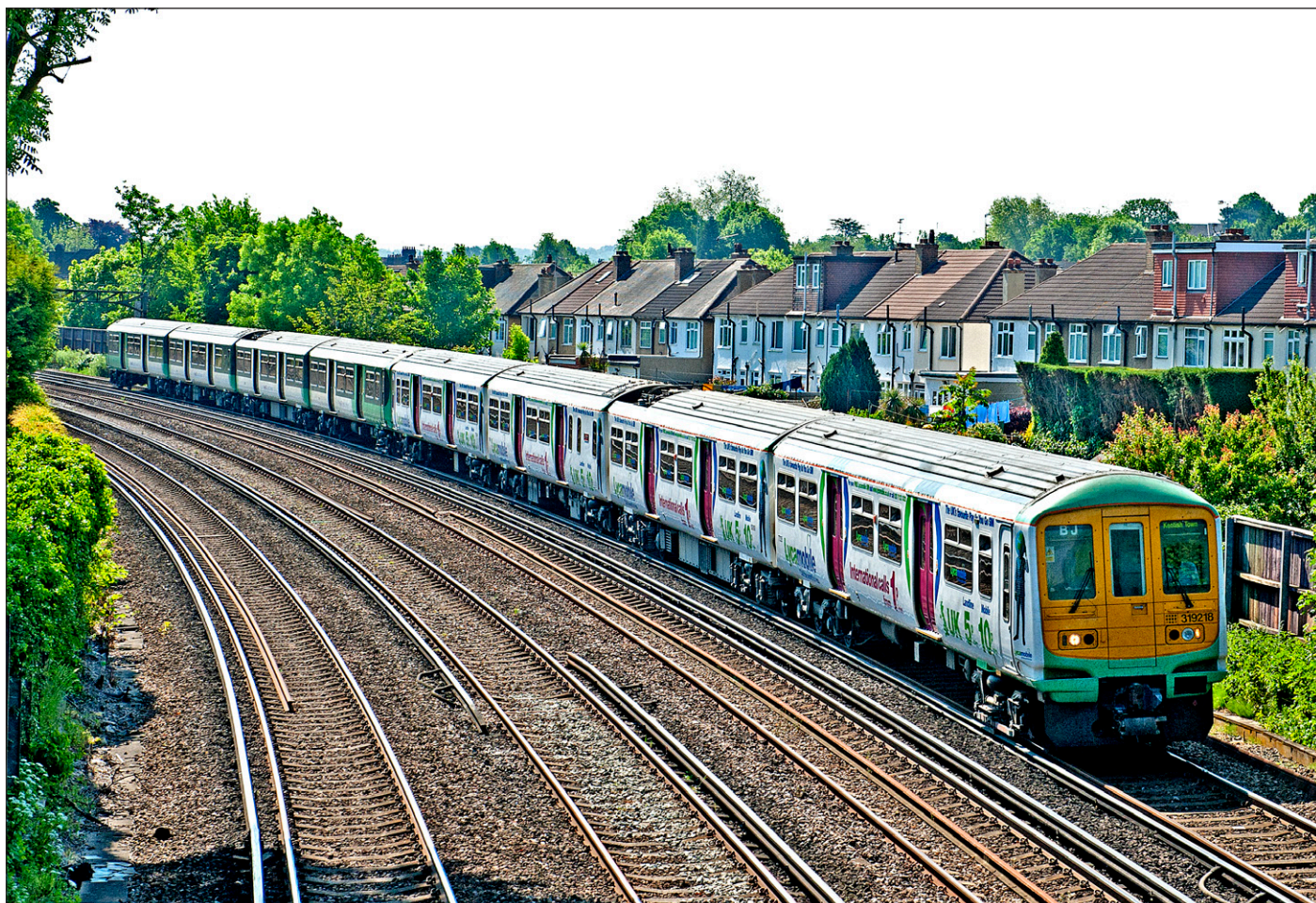
Above: With overall advertising vinyls for LycaMobile, First Capital Connect Class 319/2 No. 319218 approaches Shortlands on 30th May 2012, leading Class 319/0 No. 319008 and forming the 09:42 service from Sevenoaks to Kentish Town. Brian Morrison

25% down on the previous event eight years earlier, which attracted almost 46,500 people. The event included a partially completed Flying Scotsman , together with a range of locomotives from the modern day freight operating companies and two EMUs on the network, a 1991 ScotRail Class 334 and a Southeastern high-speed Class 395. The steam era was represented by several visitors, including 'A4' No. 60007 Sir Nigel Gresley , London Transport-liveried Pannier Tank No. 7760, and 'Jubilee' No. 45596 Bahamas .