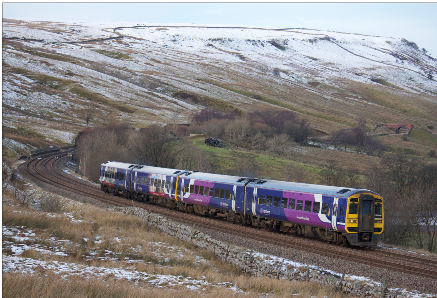
Below: On 27th January, a Northern Rail Carlisle to Leeds service led by Class 158 No. 158849, approaches the summit of Ais Gill on the Settle & Carlisle line.