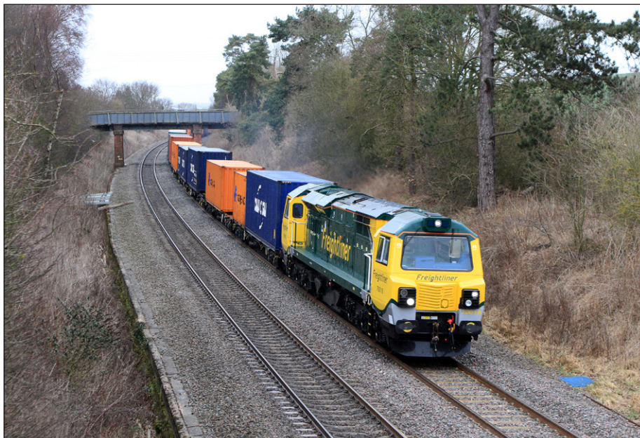
Left: The latest member of the Class 70 fleet, at the time, No. 70018 approaches Kings Sutton on 18th February working the 11:11 Lawley Street-Southampton Maritime intermodal service.