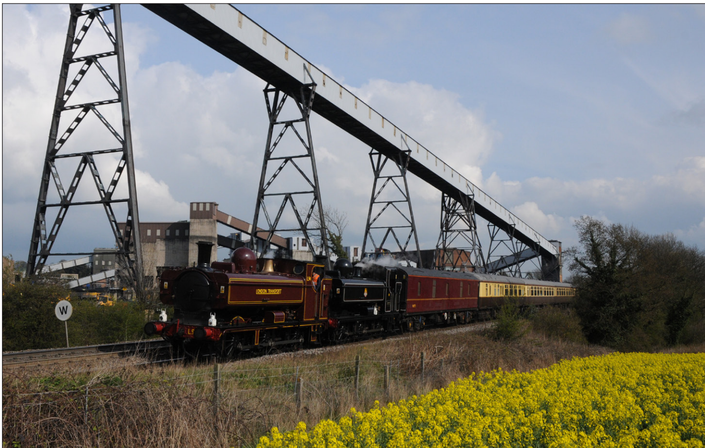
Below: Vintage Trains operated its 'Cross City Rambler' charter on the 14th April, utilising the two Tyseley-based GWR 'Panniers' for motive power. Here, London Transport-liveried No. L94 and BR lined black-liveried No. 9600 pass the colliery at Daw Mill.