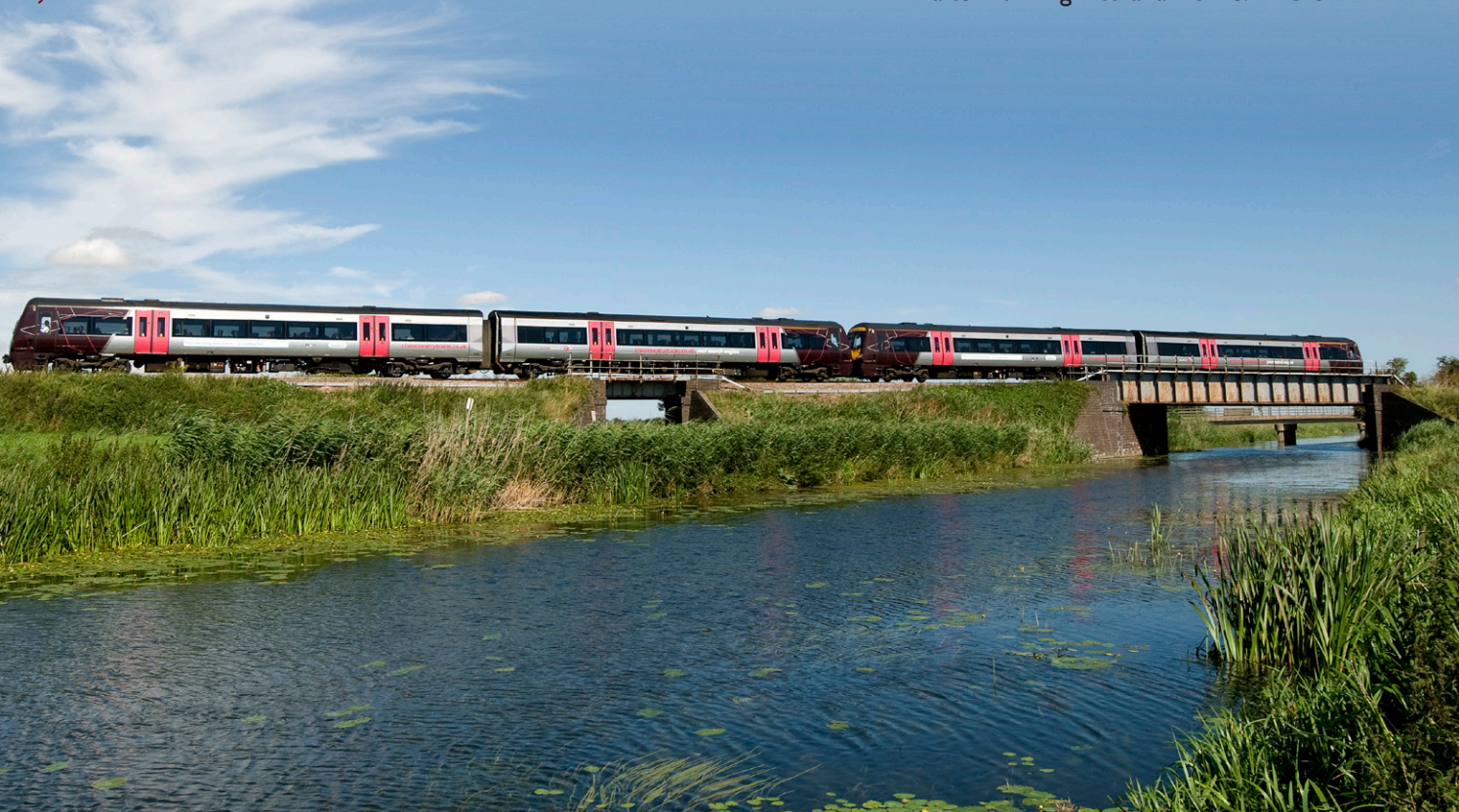
Below: At least the sun did put in the odd appearance during the summer. An unidentified Cross Country Trains Class 170 crosses the Twenty Foot River near Turves, with the 11:27 Stansted Airport to Birmingham New Street service on 18th August. Andy Moore