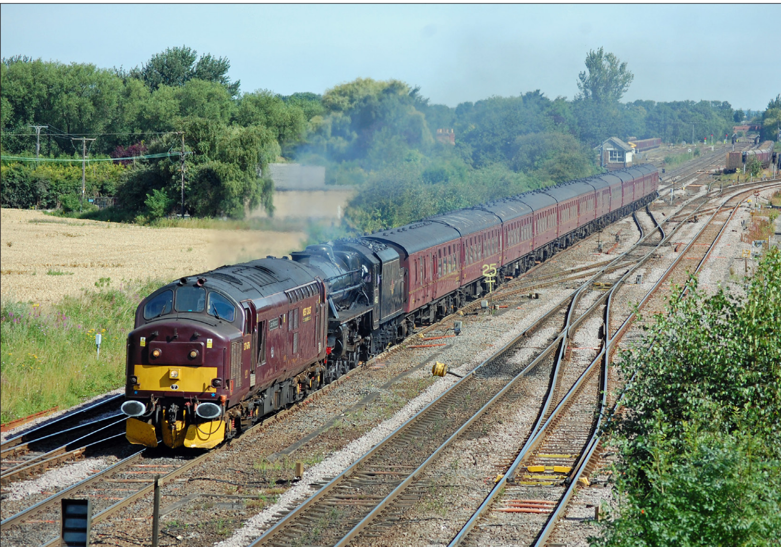
Below: West Coast Class 37/5 No. 37676 pilots LMS 'Black 5' No. 44932 through Milford Junction on 9th August, while working the 'Scarborough Spa Express'. An electrical fault on the 'Black 5' resulted in a lack of TPWS rendering the steam locomotive a failure, hence the '37'. Paul Braybrook