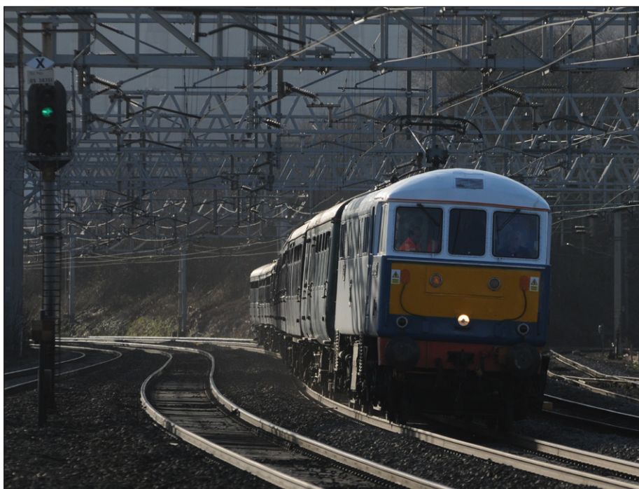
Left: The only remaining Class 86/2 locomotive still operational is the privately-owned No. 86259 Les Ross. With a harsh backlight, the locomotive leans into the curves on the approach to Rugeley Trent Valley, with the London Euston to Carnforth leg of one of the Railway Touring Company's 'Winter Cumbrian Mountain Express' charters.

On the preservation front, the National Railway Museum announced that the two exported 'A4' locomotives, Nos. 60008 Dwight D. Eisenhower and 60010 Dominion of Canada that were sent to America and Canada respectively, are to be returned