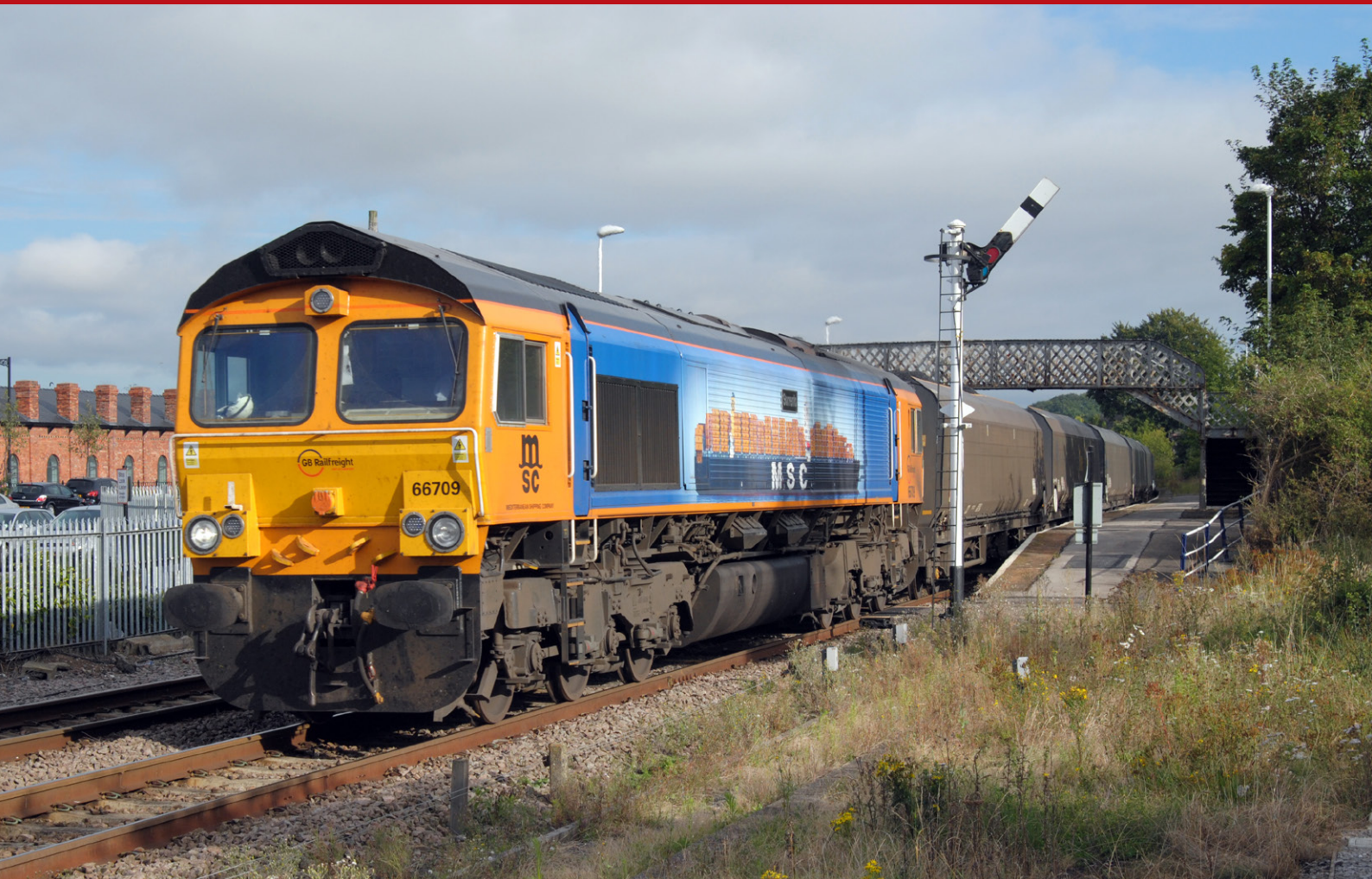
Above: With GB Railfreight's locomotive fleet being common-user, those named in connection with a particular industry, or carrying a livery connected with a specific customer can turn up on other traffic. One location not often featured in the railway press is Gainborough Central, seen here with the unique-MSCLiveried Class 66/7 No. 66709 Sorrento passing through on a loaded coal working bound for Eggborough Power Station from Immingham on 4th September. Simon Craig