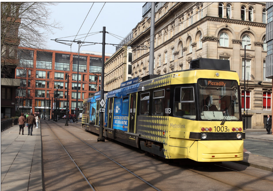
Below: Although the original 1000 series trams in Manchester are now starting to be replaced by the latest Bombardier-built Flexity design, a small number of the original fleet are gaining the latest colours. Here, No. 1003 heads for Piccadilly along Aytoun Street on 23rd March. Jonathan Stevenson