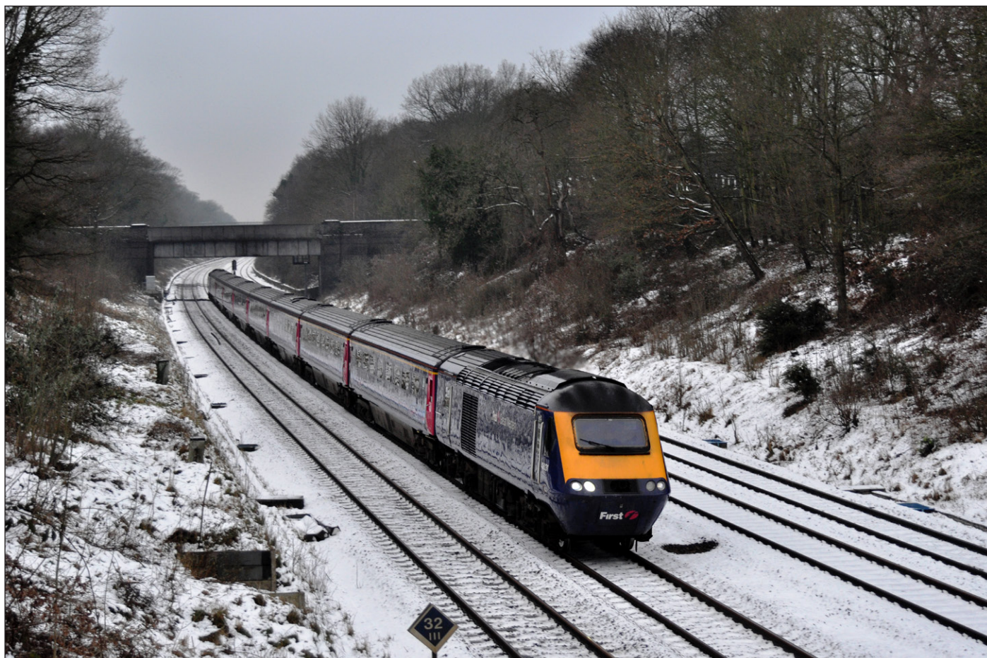
Above: The last days of January saw the temperatures starting to dip and the snow arrive. Here, FGW Class 43 No. 43031 heads through Sonning Cutting towards London. Ian Hall