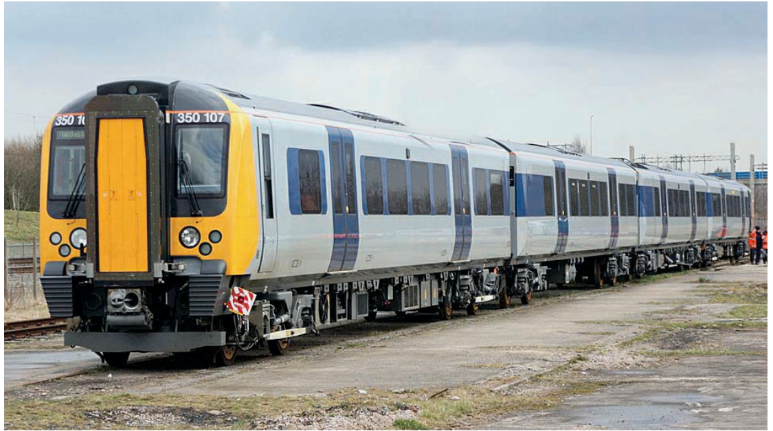
ABOVE: Class 350 No. 350107 stands at Stoke on 10th March. These units will operate a variety of routes stretching from London to Preston.

The new Siemens constructed Class 350/1 'Desiro' units for the West Coast Main Line were previewed to the railway press on 10th March. The trains, which have been built in Germany and tested at the Wildenrath test track, are four car units, although only the end driving vehicles are powered with two traction motors per bogie. The units are standard class with the exception of a third of one of the centre vehicles which provides first class accommodation, which itself features a two-