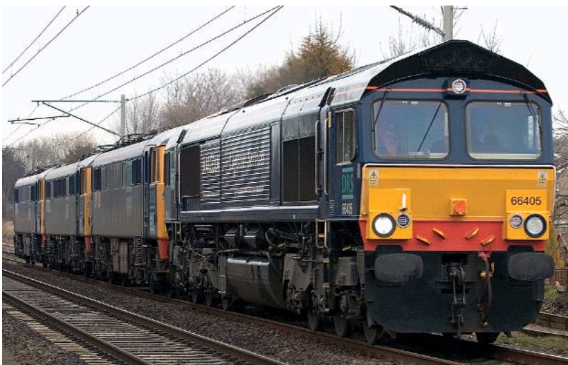
ABOVE: On the 14th March, Direct Rail Services used Class 66/4 No. 66405 to move its three Class 87 locomotives (Nos. 87028, 87022 & 87006) from Carlisle Kingmoor to Manchester Longsight. The electric's have only made a couple of appearances on the DRS intermodal services and the reason for their move south is not currently known.

Despite all the problems which will need to be overcome, campaigners are confident that the trains will be running over the Waverley Route to Tweedbank in 2008.