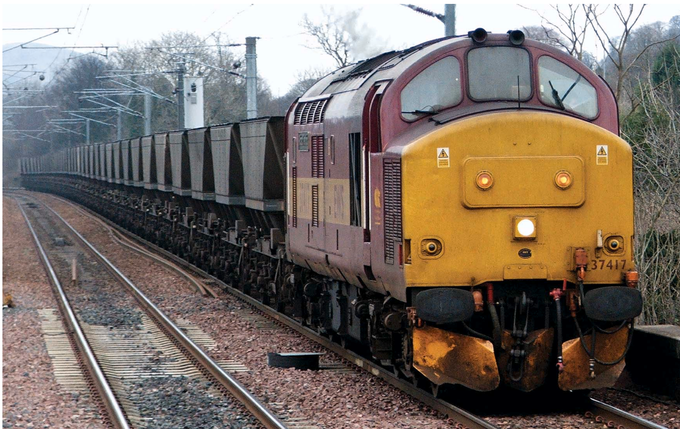
ABOVE: Class 37/4 No. 37417 powers through Kingsknowe near Edinburgh with 6D80 09.24 Millerhill Yard to Mossend Yard service on 14th March, running several hours late. The move of HAA coal wagons on this occasion being due to an imbalance of vehicles and this particular set being required in Ayrshire.